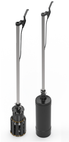
HP & HS Lifting Tool