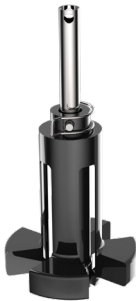
ZG8 – ZG10 GMP5000 – GMP20000 SM120H, SM210 Lifting Tool