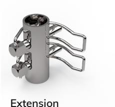
Extension Socket Kit