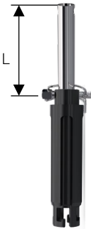
ZG3 – ZG7 GMP100 – GMP2000 SM85, SM120 Lifting Tool